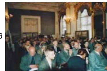
St. Petersburg, 2006