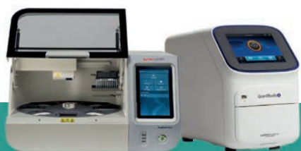
Амплификаторы QuantStudio 5 и системы экстракции нуклеиновых кислот KingFisher Apex для ПЦР