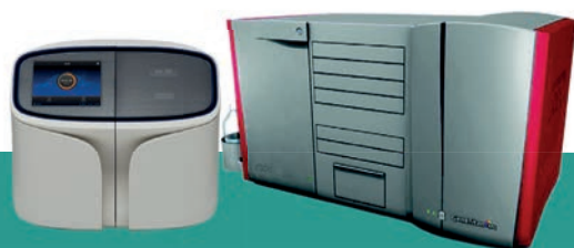
Системы IonGeneStudio S5 и GeneTitan для генетических исследований