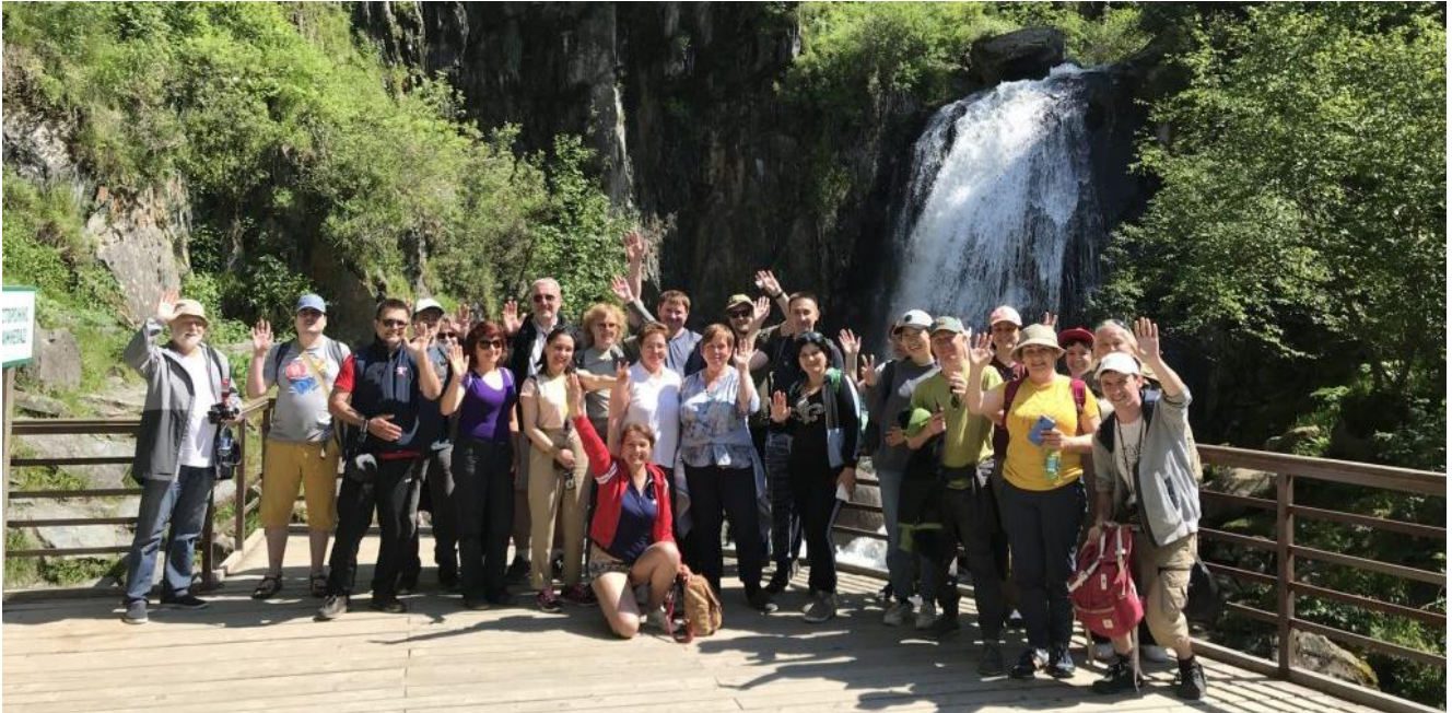
June 2021: participants of the post-conference tour to Altai "Legends of Lake Teletskoye" (conference of the ICiG SB RAS: PlantGen-2021 ).

Minor changes in the program are possible (depending on weather conditions, by agreement with the customer of the group).