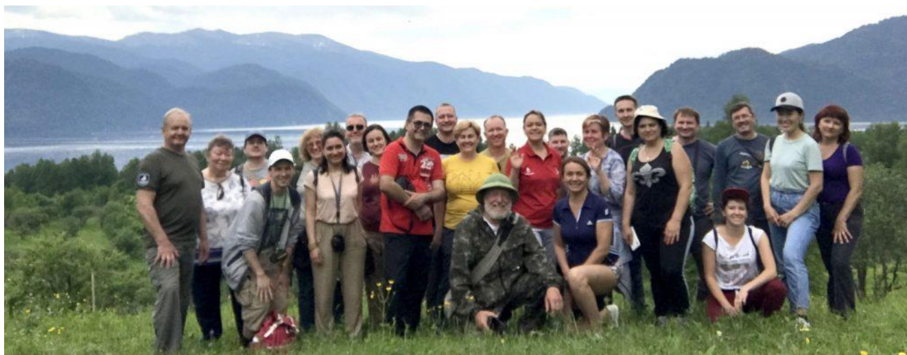
June 2021: participants of the post-conference tour to Altai "Legends of Lake Teletskoye" (conference of the ICiG SB RAS: PlantGen-2021 ).

The tour does not require special professional training and sports skills. To participate in hiking under the program, you will need good health and comfortable shoes.