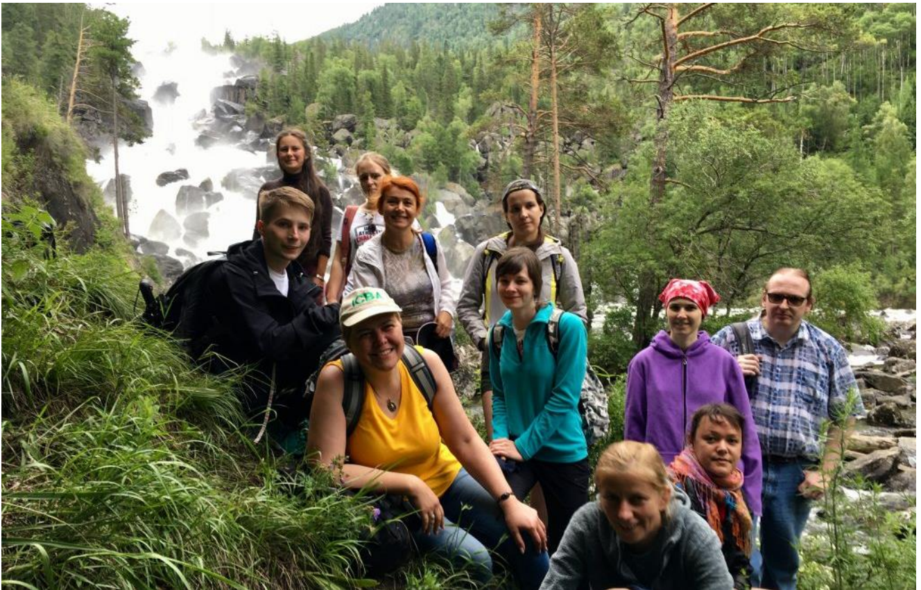
July 2019: participants of the Altai post-conference tour "Heart of Gorny Altai" (29.06-03.07.2019), who reached the Uchar waterfall (ICiG SB RAS conference: PlantGen-2019 ).