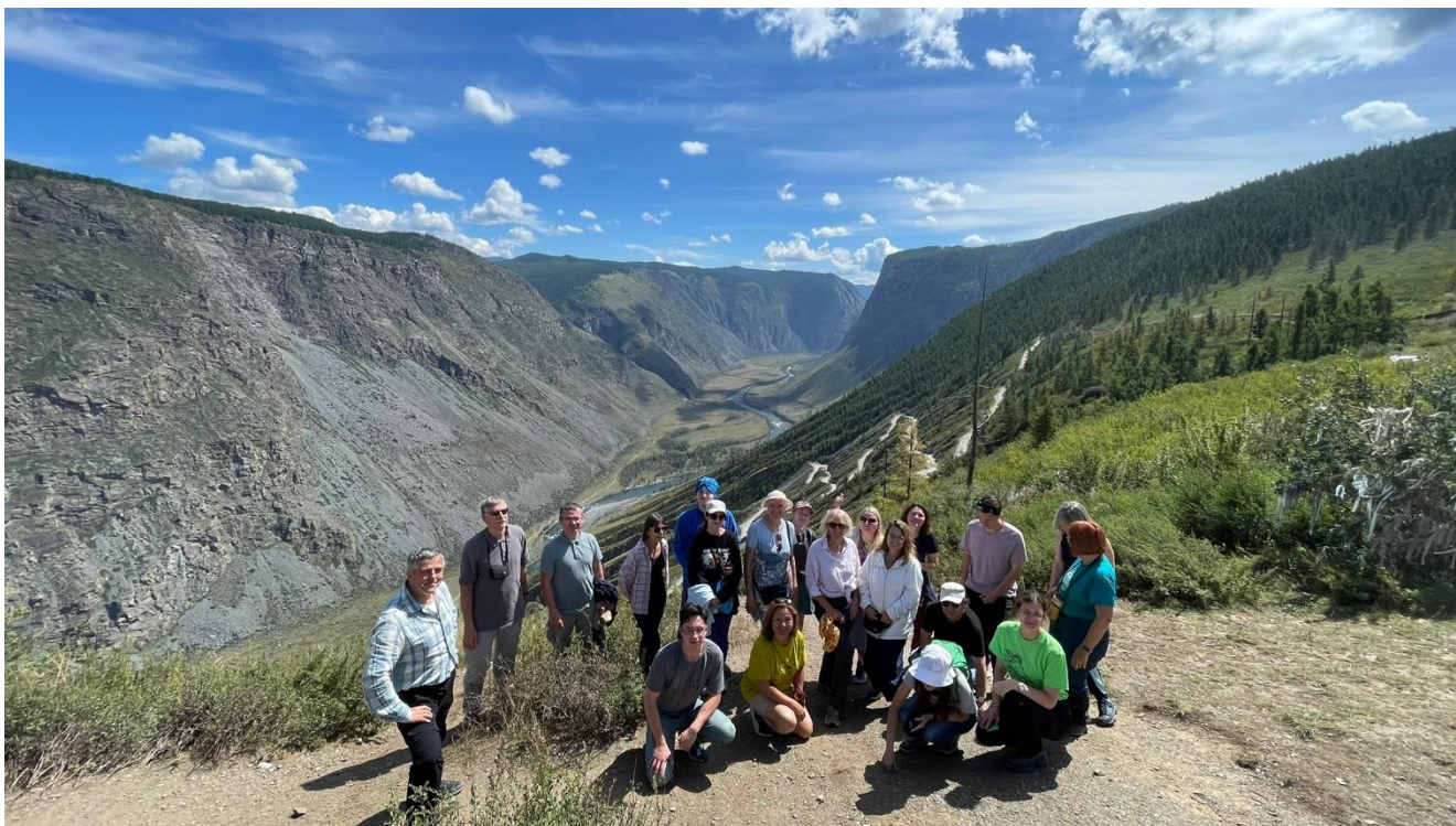
August 2024: participants of the post-conference tour to Altai "Natoyashchy Altai" (ICiG SB RAS conference: BGRS/SB-2024 ).

Electricity at the camping site from the generator and only for a couple of hours. Here our phones are needed only as photo and video cameras. In bungalow, USB can be used to charge phones. And the silence is broken only by the noise of the river Chulyshman, which carries its waters through the whole valley to the south of Lake Teletskoye. It is the best place to meditate and free your head from the city fuss. And the Altai bathhouse will help you in this))